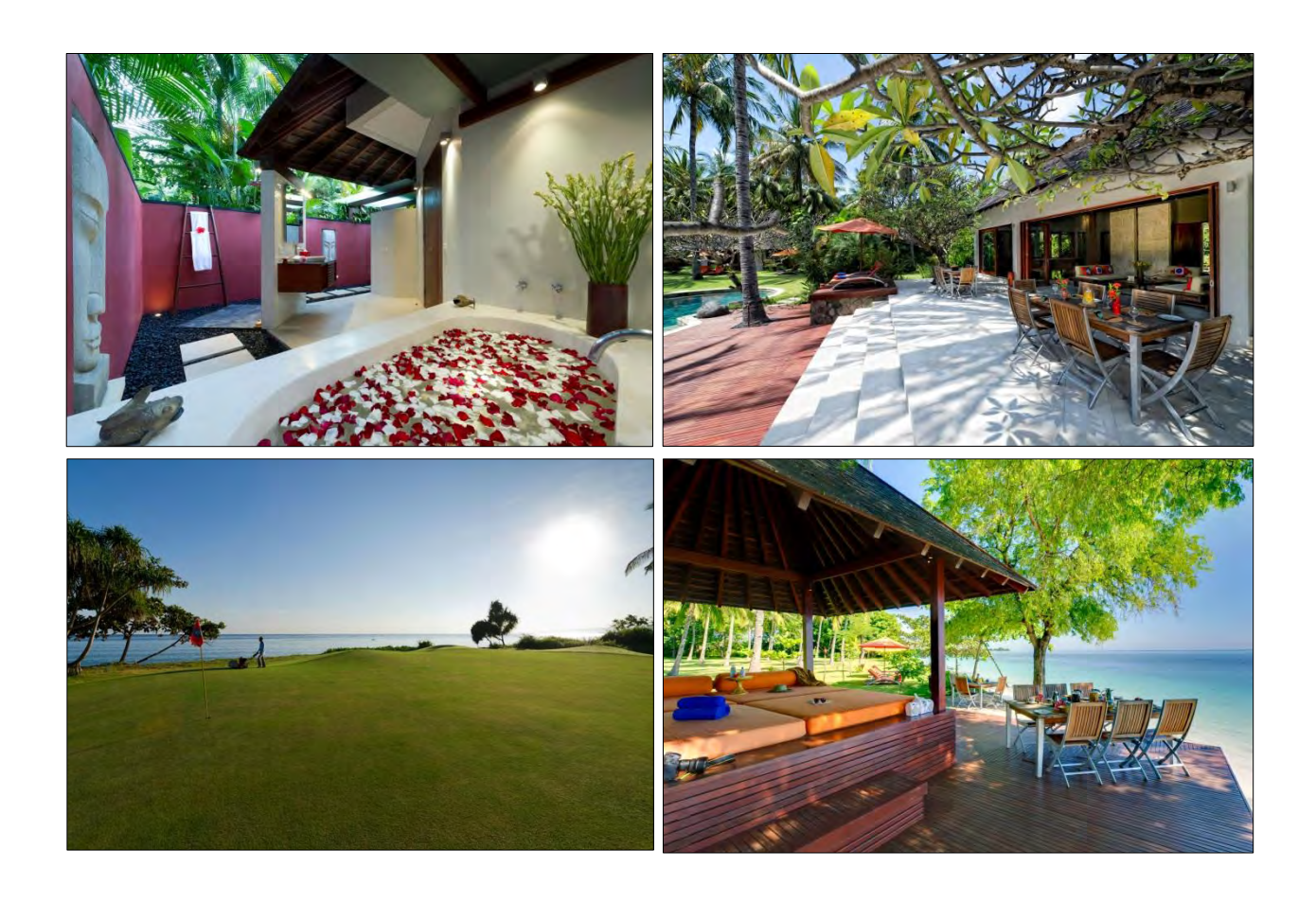
VILLA ANANDITA - LOMBOK, INDONESIA

Nestled in a picturesque coconut grove on the north-west coast of the Indonesian island of Lombok, Villa Anandita is a tranquil, luxurious retreat managed by a team of professional, dedicated staff committed to providing guests with a unique blend of hospitality and personalized service. In addition to its stunning oceanfront location and lush tropical gardens, the villa stands out for its stylish interiors, which combine elegant Asian design with inspiring artwork and modern comforts while flowing seamlessly onto the outdoors. The property boasts four lovely bedroom pavilions, each with its own character, vivid color scheme, and luxurious bathroom appointed with monsoon shower and lavish soaking tub. A magnificent swimming pool and a glorious collection of Asian-influenced indoor and outdoor spaces complement the long list of amenities.